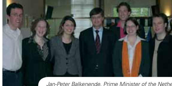
Jan-Peter Balkenende, Prime Minister of the Netherlands with Dutch students of the Montesquieu promotion.

Jan Peter Balkenende, Head of the Dutch Government – a partner in the project – opened the conference with a speech devoted to the future of European development.