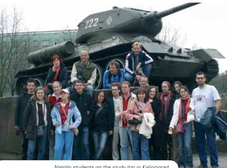
Natolin students on the study trip in Kaliningrad.

L'idée d'un voyage permettant de faire vivre les connaissances acquises dans la filière PECO, s'est imposée naturellement afin de comprendre et de s'imprégner physiquement d'une réalité qui est le voisinage proche de l'Union Européenne élargie.