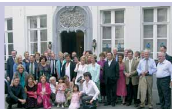
Aristide Briand Promotion during their anniversary weekend

Vous trouverez de plus amples informations sur le déroulement du Prix sur notre site ou dans notre prochaine édition.