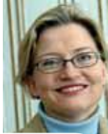
Anna Lindh, late Swedish Foreign Minister

"A culture of prevention requires the imagination to see ahead to the consequences of our inaction. And it demands the political will and courage to take preventive action where this is costly, dangerous or unpopular and where the benefits may never be seen." Javier Solana, January 2004