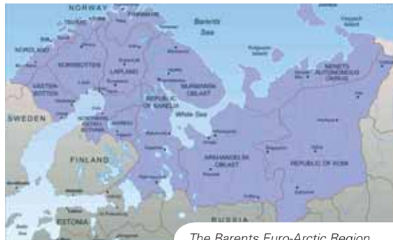
The Barents Euro-Arctic Region

strategic location for shipping have raised the interest of powerful states as well as international companies and given the region more importance for the EU, as stated in the Northern Dimension Action Plan 2004-2006.