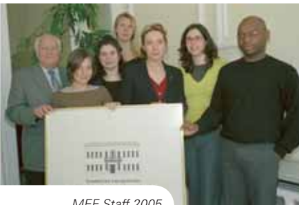
MEF Staff 2005

Le projet FISH (Flight against SHip-Source pollution), mis en œuvre par la Fondation Madariaga avec le soutien de la Commission européenne, vise à dresser un état des lieux sur la réglementation applicable, en tenant compte des nouvelles perspectives offertes par l'évolution récente de la réglementation européenne avec la reconnaissance du concept de "crime environnemental". Les 3 et 4 mai, une conférence s'est tenue à la Fondation Madariaga, réunissant des spécialistes du droit pénal appliqué à la lutte contre la pollution maritime. Le programme de la conférence et les interventions sont disponibles sur le site www.madariaga.org .