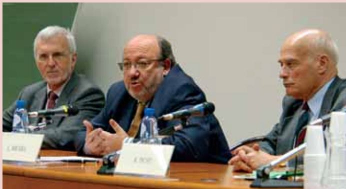
Louis Michel, European Commissioner, spoke to students in Bruges in March on his experiences with Development and Humanitarian Aid.

In view of the success of the previous editions, the programme will be organised for a third time in October 2005. Two sessions are planned each year.