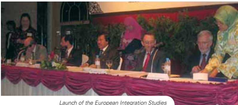
Launch of the European Integration Studies Programme at the Universiti Sains Malaysia.

In the framework of the EU's Asia-Link Programme and in partnership with the University of Tübingen (Germany) and the Chulalongkorn University (Bangkok, Thailand), the Development Office of the College of Europe is implementing a core curriculum in European Integration Studies at the School for Social Sciences of the Universiti Sains Malaysia (USM) in Penang (Malaysia). This three-year project started in July 2004 and aims at creating in Malaysia a sound and profound expertise of European policies, institutions and developments as well as a better awareness of the EU's relations with Asia, e.g. Malaysia.