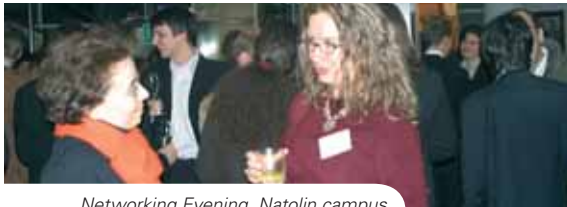
Networking Evening, Natolin campus.

Each year we ask alumni and recruiters to meet with students in the framework of information workshops on the European job market (lobbying, networking, internships in the institutions, the different activity sectors...). Job offers that are sent through the network are also due to the work and dedication of many alumni.