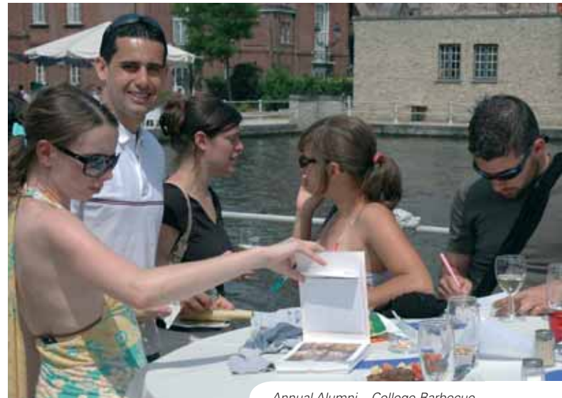
Annual Alumni – College Barbecue.

Nous invitons les Anciens qui fêteront l'année prochaine leur anniversaire de promotion (Promotions Walter Hallstein, Christophe Colomb, Czartoryski, Thomas More, Virgile) à se mobiliser et à nous faire parvenir leur changement d'adresse.