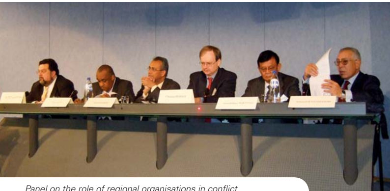
Panel on the role of regional organisations in conflict prevention

In the afternoon, on the eve of the Annapolis summit, the discussions focussed on the Middle-East and the Mediterranean regions. Panellists exchanged views on how to sustain the peace process from a conflict prevention perspective, touching upon issues such as the management of natural resources, the intercultural dialogue, the handling of migration, and the revitalisation of economic activity.