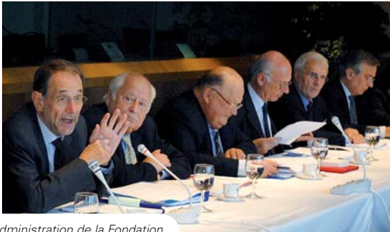
Conseil d'administration de la Fondation