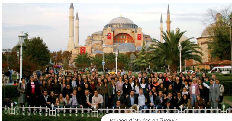
Voyage d'études en Turquie

Tous les étudiants du campus de Natolin ont participé ce novembre à un voyage d'études à Istanbul. La réflexion sur la situation actuelle en Turquie avait déjà commencé avant le départ dans le cadre de groupes de travail. Puis, pendant le séjour à Istanbul, une série de conférences furent organisées qui permirent de faire le point sur l'état des relations entre la Turquie et l'Union européenne et sur les questions de son adhésion éventuelle à l'Union européenne. Selon la conception interdisciplinaire du programme d'études de Natolin, les intervenants ont débattu des questions politiques et économiques, mais aussi sociologiques et historiques. La contribution de Murat Belge, un ami de Hrant Dink, un des patrons de notre promotion, a été particulièrement appréciée.