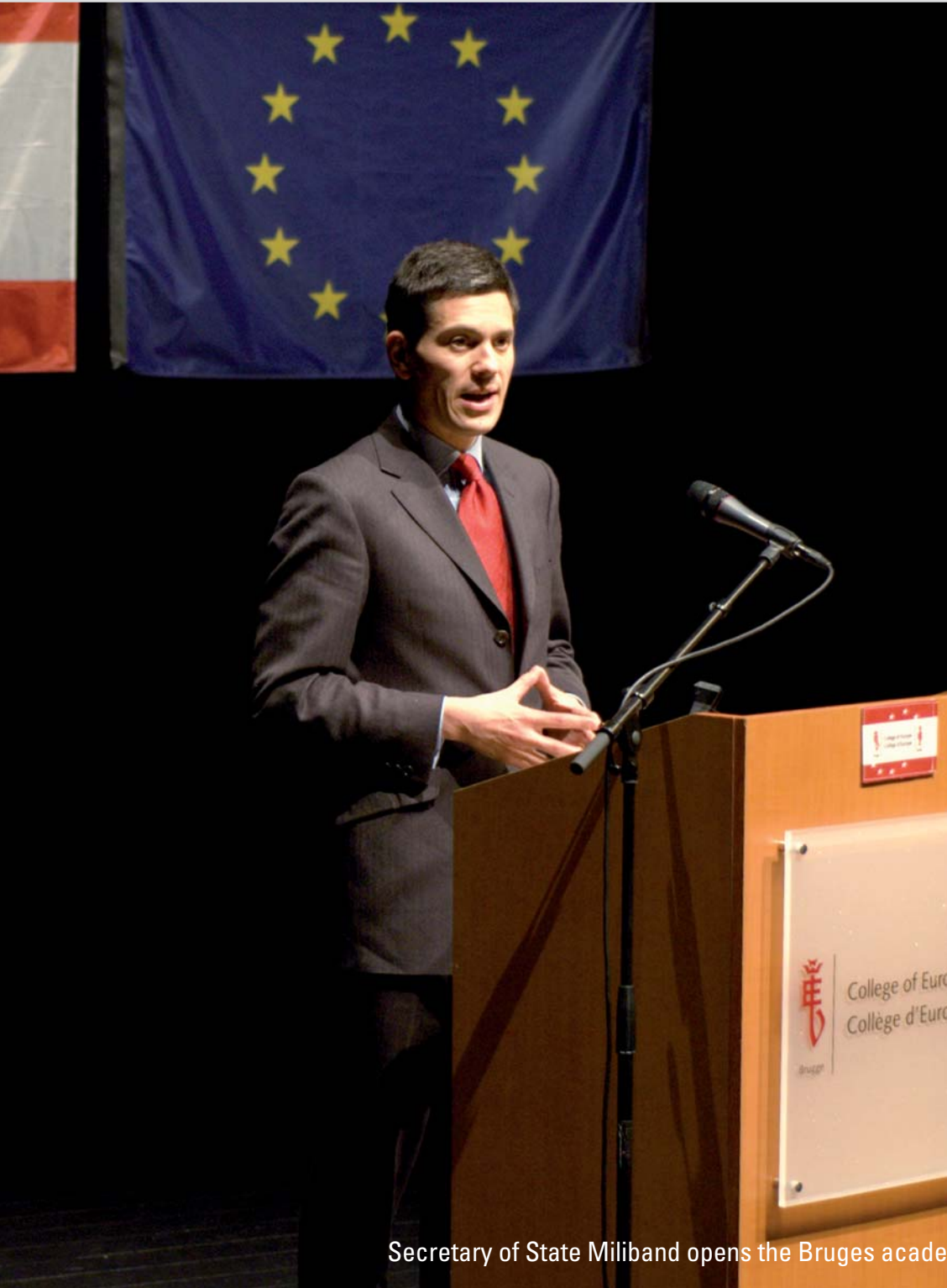
Secretary of State Miliband opens the Bruges academic year