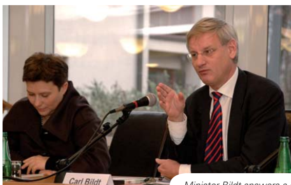
Minister Bildt answers a question

In his speech on the future of Europe, Mr Bildt recalled that "our Europe has never been as free, as prosperous or as secure as it is today." In addition, he emphasised that in this age of globalisation all nations should be developing countries prepared to adopt changes, including the EU. He spoke in favour of further EU enlargement as a way of promoting peace and stability in the region.