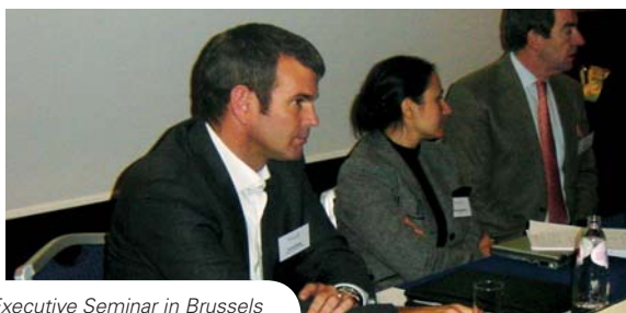
Executive Seminar in Brussels