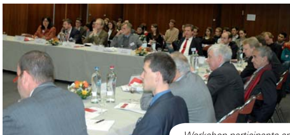
Workshop participants and student attendees

On 26 and 27 October, the Department of EU International Relations and Diplomacy Studies organised an international workshop on transatlantic relations with the support of the GE Foundation. The workshop gathered about thirty leading experts, academics as well as practitioners, from both sides of the Atlantic, as well as a number of College students. The workshop assessed the current state of the transatlantic relationship from a political and economic point of view while also looking at future prospects.