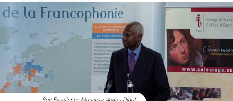
Son Excellence Monsieur Abdou Diouf

Le 20 septembre dernier, Son Excellence Monsieur Abdou Diouf, ancien Premier ministre et Président du Sénégal, a présenté une conférence sur le campus de Bruges. L'importance de l'Organisation Internationale de la Francophonie a été mise en exergue par son Excellence qui en assure également la présidence. Il soulignera la capacité unificatrice de cette organisation, dont découle sa légitimité, qui trouve ses origines dans des mouvements populaires ayant pour socle commun la langue française. Prônant la diversité culturelle en favorisant une vie internationale qui ne se résume pas à une seule langue, le message du Secrétaire général peut faire écho à la multiculturalité et au multilinguisme qui sont des fondements de la vie des étudiants au Collège d'Europe. Hormis l'appel à ne pas céder trop aisément à la langue anglaise, le discours de Son Excellence Monsieur Diouf est selon moi, une exhortation à être fier de nos cultures respectives.