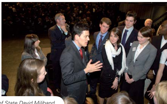
Secretary of State David Miliband speaks with British students

Recalling the words used almost 20 years ago by the then British Prime Minister Margaret Thatcher, he stated, "Our destiny is in Europe." Rather than attack the European dream, however, the Foreign Secretary projected a very different vision for Europe. He rejected the idea of a European superstate but endorsed integration and supported further expansion of the single market. He mentioned the need for Europe to make use of both soft and hard power to advance democracy and put much emphasis on environmental goals.