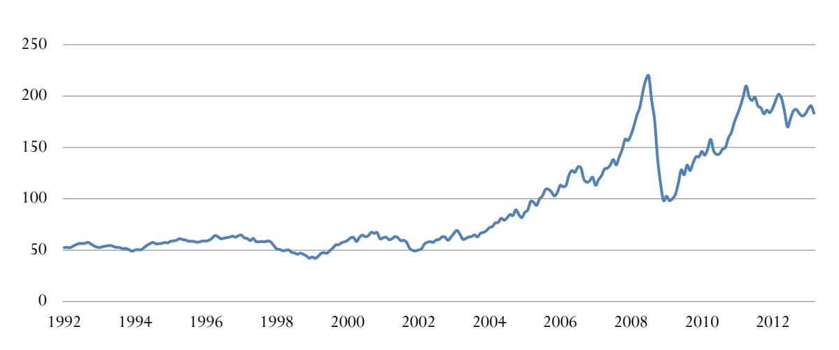
Figure 1: monthly commodity price index from 1992 to 2013

High resource price levels<sup>13</sup> are the main incentive to increase resource productivity, as they increase the probability for investments in resource efficiency to pay off. The International Monetary Fund (IMF) all commodity index increased by 131% between 1992 and 2013 (see figure 1) below. Thus, there should be an incentive to become more efficient and therefore gain an advantage over competitors in terms of product prices or quality.