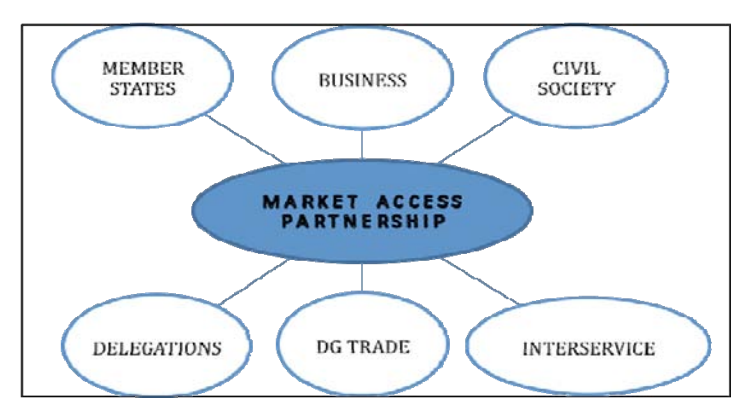
Figure 1: Participants in the Market Access Partnership<sup>22</sup>

participating not only through the Council and their Economic Counsellors in the 'Article 133 Committee' but also through their embassies in third countries. Finally, business is mostly represented through business associations. In some cases, the Market Access Partnership is also open for participation of representatives of civil society. In ideal circumstances, all stakeholders enumerated above act jointly through the committees and teams provided by the platform of the Market Access Partnership in order to detect, analyse and remove trade barriers in third countries (see Figure 1).