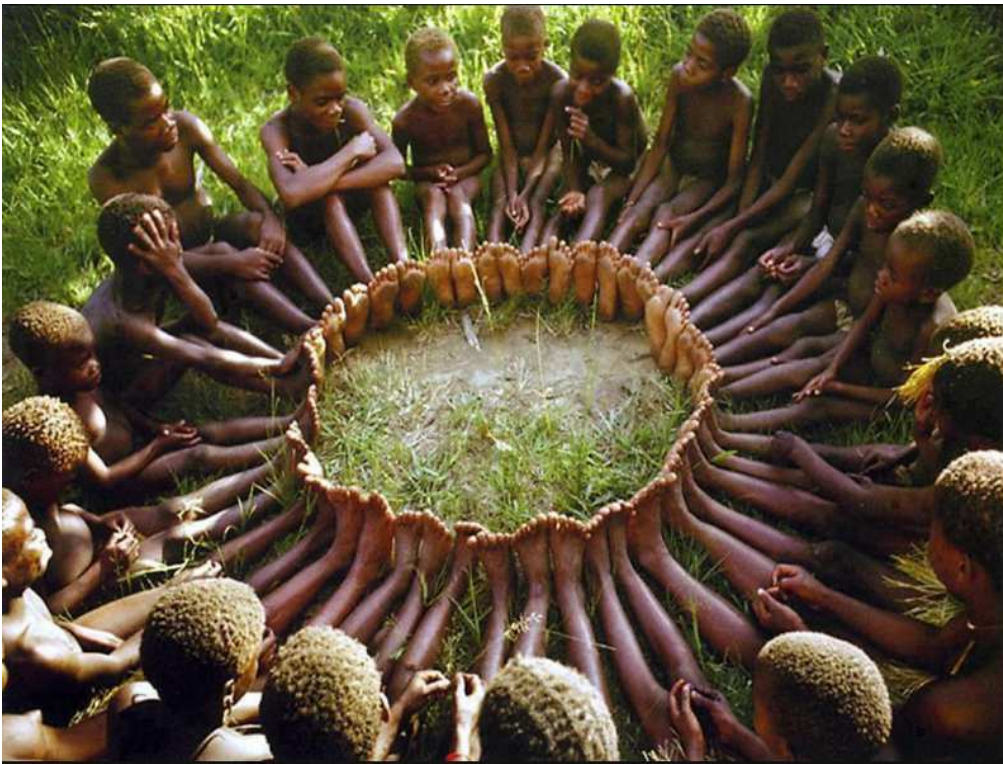
Osani circle game / Ubuntu

Our sense of fairness is affected by cultural background, personality, a variety of unconscious biases and “rules of naive accounting that diverge in major ways from the standards of rationality assumed in economic analysis.”