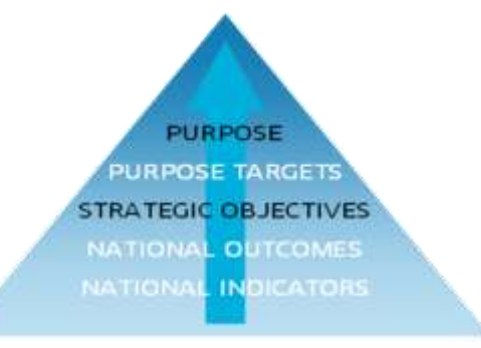
Figure 2: The National Performance Framework